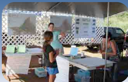
A young North Shore resident shares her input with Greenprint volunteers at the Hale'iwa Farmers Market on Feb. 27, 2011