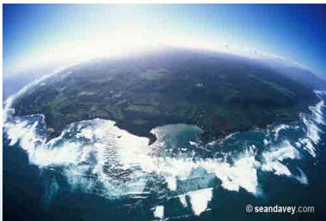
Greenprinting Will Help the Community Map a Positive Future

Newly created interactive GIS maps (created through community input) will highlight and prioritize key protection areas for food security, important scenic views and coastline, wildlife habitat and trail connections - as identified by the local people who use them. This plan will help the community play a leadership role in guiding future conservation